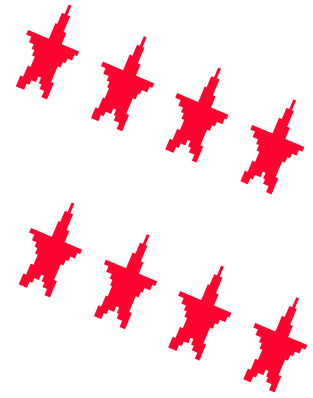
Fryemont Inn June 18 Bryson city