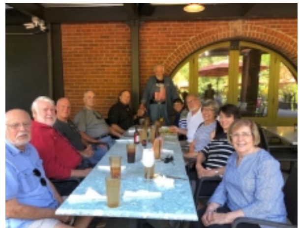
Tapoco Lodge July 23 Robbinsville