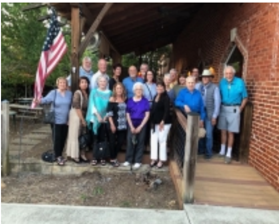
Granier's Aug 24