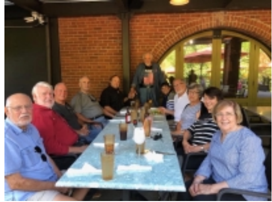
Topco lodge July 23