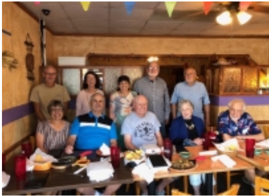
El Pacefeco Aug 13