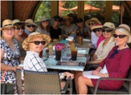
Ladies Lunch - Tapoco Lodge July 26