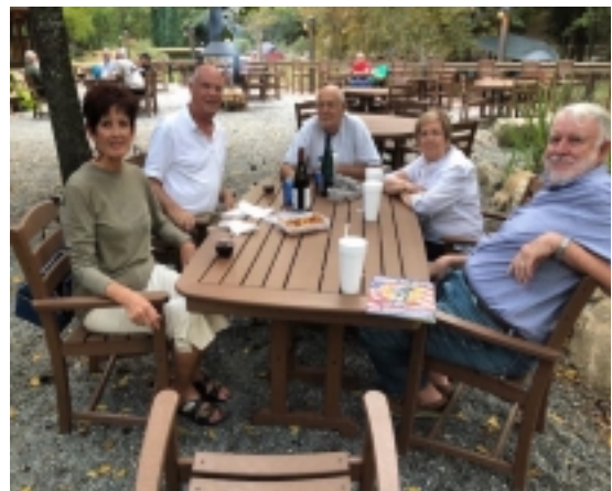
Iron Horse Sept 28