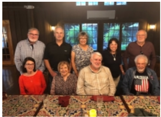
Fryemont Inn Aug 27